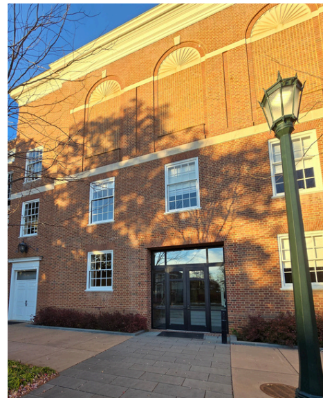
Enter from JPA^

There are two entrances to Wilson Hall: If you enter from Jefferson Park Avenue (JPA), you will be on the first floor and need to take a stairway or small elevator to go up. You may also enter the building from the courtyard side, facing Robertson and Rouss Hall (RRH)