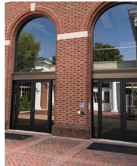
Enter from RRH^

If entering from the RRH/courtyard side, you will be on the 3rd floor. Facing away from the door, turn left and you will find the classroom Wilson 325 in the corner behind the Recycle bin.